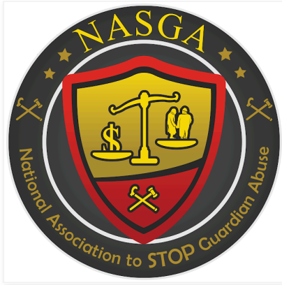
Stop Guardianship / Conservatorship Abuse © 2006 NASGA

NASGA (National Association to STOP Guardian Abuse, Inc.) is a 501(c)(3) public-interest, civil rights organization formed by victims of unlawful and abusive guardianships and conservatorships. We seek legislative reform of existing law and upgrading of criminal penalties for court-appointed fiduciaries misusing protective proceedings for unjust enrichment and engaging in elder and family abuse.